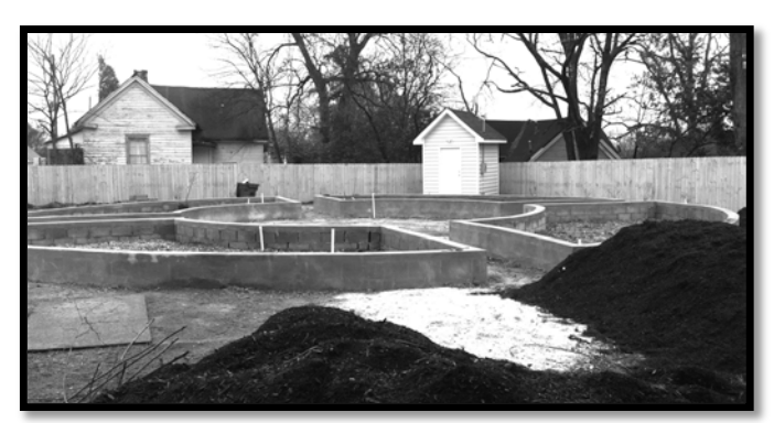
Construction Underway at the New Community Garden

As a result, they've experienced very-low turnover among tenants and are regularly asked about vacancies.