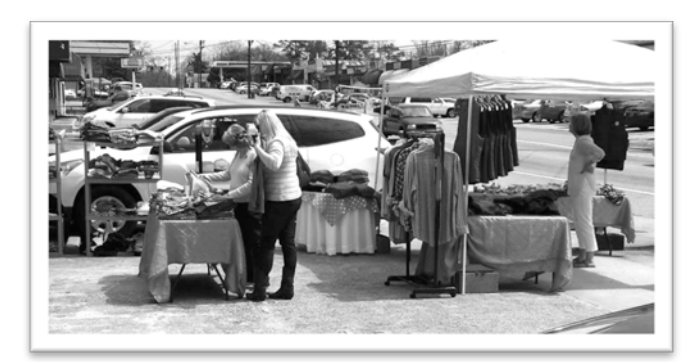
Shop and Stroll in Ingleside Village

Early spring we supported our neighbors and locally owned historic shops on Ingleside. The Vineville Neighborhood Association sponsored a Spring Shop & Stroll in the village. There were many specials for all that came out to support all of these unique shop and restaurants. I hope that this is something that the Ingleside Village merchants will continue to do. I loved spending this beautiful spring day in the Village.