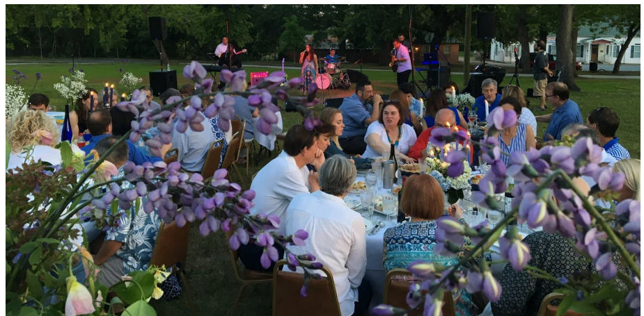
Partygoers at the 2018 Blue and White Party